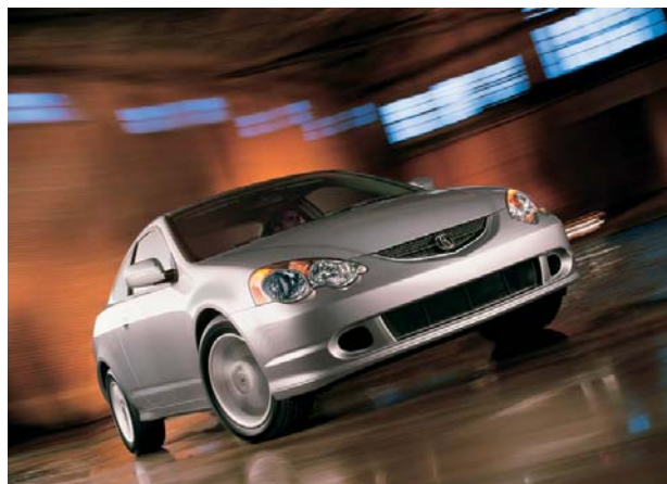
Honda Acura RSX, equipped with the new 5-speed automatic transmission system.

This is all made possible by employing advanced technology such as ultra-flat torque converters, which make the transmission more compact, and the world's first ever clutch pressure control system using linear solenoids.