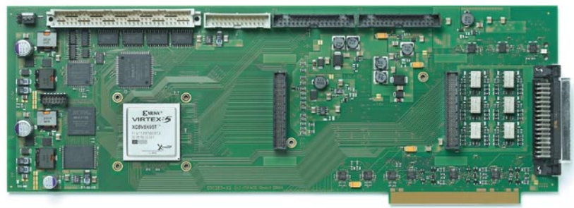
The new DS5203 FPGA Board.

For connecting external sensors and actuators, the DS5203 provides 6 ADC,